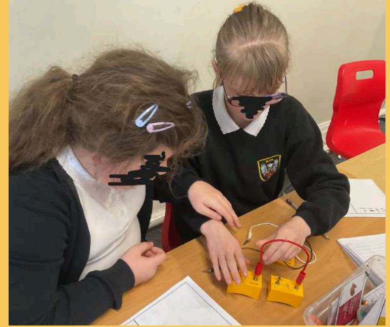
Headteachers Award Trip