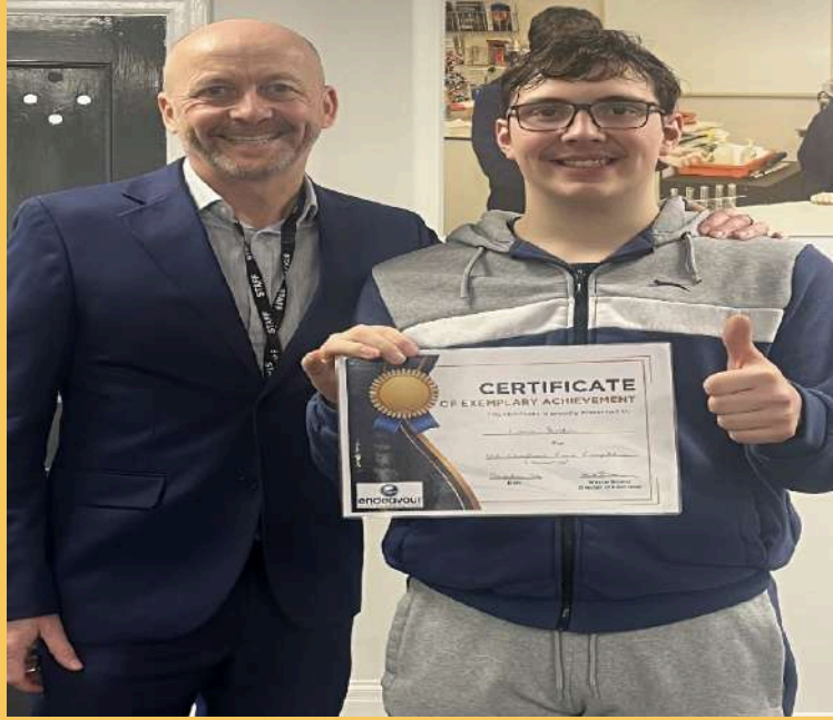
Achievement Award Winner